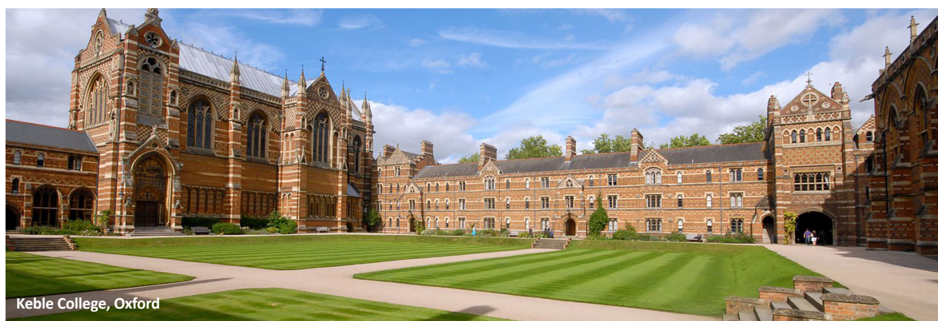
Keble College, Oxford