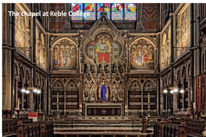
The chapel at Keble College